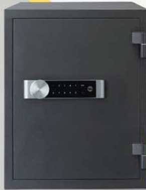
DOCUMENT SAFE PROFESSIONAL YFM/520/FG2 Exterior dimensions: 522 x 404 x 440 mm Interior dimensions: 410 x 300 x 300 mm Net weight: 53kg Volume: 36.9litres