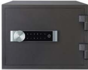
DOCUMENT SAFE HOME YFM/310/FG2 Exterior dimensions: 308 x 410 x 342 mm Interior dimensions: 220 x 330 x 225 mm Net weight: 26kg Volume: 16.3litres