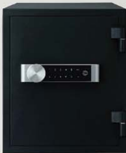
DATA SAFE OFFICE YDM/420/FG3 Exterior dimensions: 420 x 352 x 433 mm Interior dimensions: 224 x 157 x 206 mm Net weight: 43kg Volume: 7.2litres