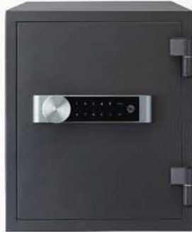
DOCUMENT SAFE OFFICE YFM/420/FG2 Exterior dimensions: 420 x 352 x 433 mm Interior dimensions: 320 x 260 x 304 mm Net weight: 36kg Volume: 25.3litres