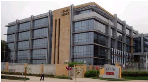
CISCO campus-Bangalore, India