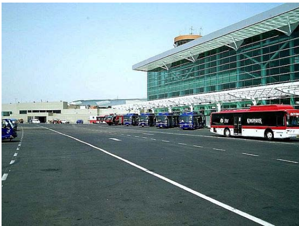
Delhi International Airport Limited (DIAL)