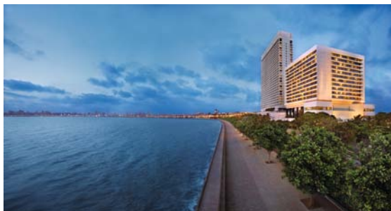
Trident Hotel-Mumbai, India