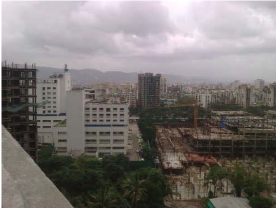
Jupiter Hospital-Thane, India