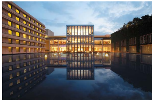
The Oberoi- Gurgaon, India