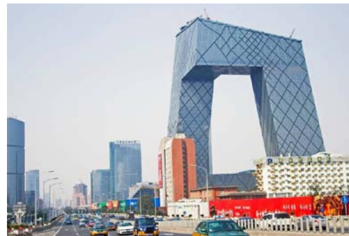
CCTV headquarters-Beijing, China