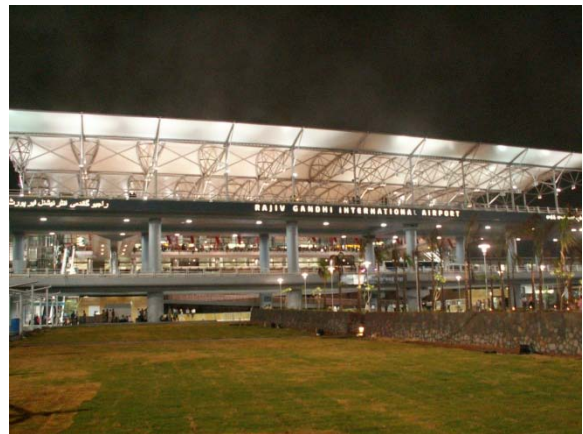
Hyderabad International Airport