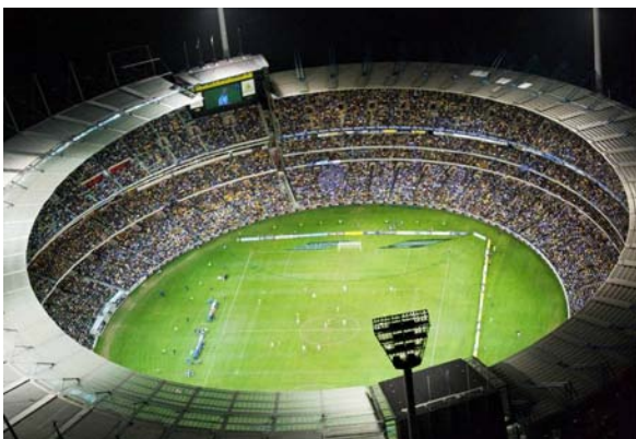
Melbourne Cricket Ground, Australia