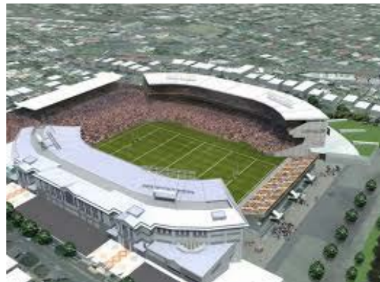
Eden park, New Zealand